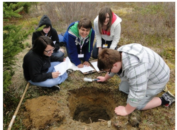
Conne River team during the "Soils" field test.

"NCIS: Newfoundland's Current Issue Solutions" from Elwood High School, in Deer Lake, also took home the award for best score